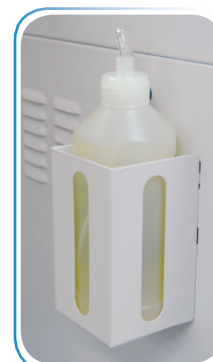
Optional EvenFlow™ Automatic Oiling System

*Capacity varies depending on paper and power supply