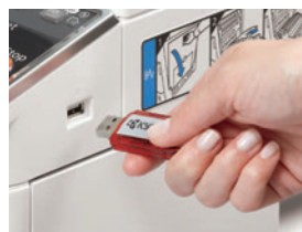
Convenient print-from and scan-to USB drive right from the touch screen panel in PDF, JPG, TIFF and XPS file formats.