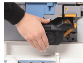
Easily replaceable toner container with a high yield of 15,000 pages.

Specifications and design are subject to change without notice. For the latest on connectivity visit www.kyoceradocumentsolutions.com/us .