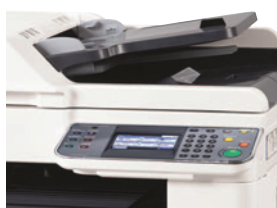
The reverse automatic document processor scans double-sided documents for speed and efficiency.