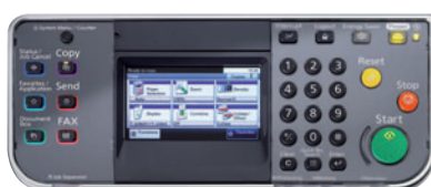
Customizable, color touch screen offers fast, easy access to frequently used functions.